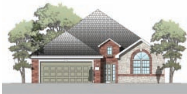
Future Bridgeview Estates Executive Home

Bridgeview Estates, a neighborhood of individual executive homes, will be constructed contiguous to the CCC campus in Mesquite. In a picturesque setting of approximately 20 acres of rolling land with beautiful trees, Bridgeview Estates will have individual homes and a clubhouse. Its focal point will be a beautiful bridge - hence the name Bridgeview. The homes will be spacious, beautifully appointed 2- and 3-bedroom plans, each with 2-car garages, and landscaped yards. Residents of Bridgeview Estates